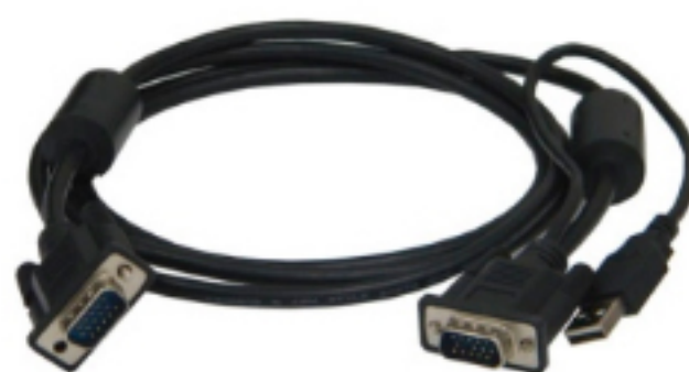
USB KVM Cable