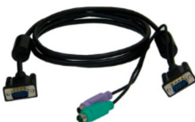
PS2 KVM Cable