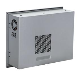
▲ Back view