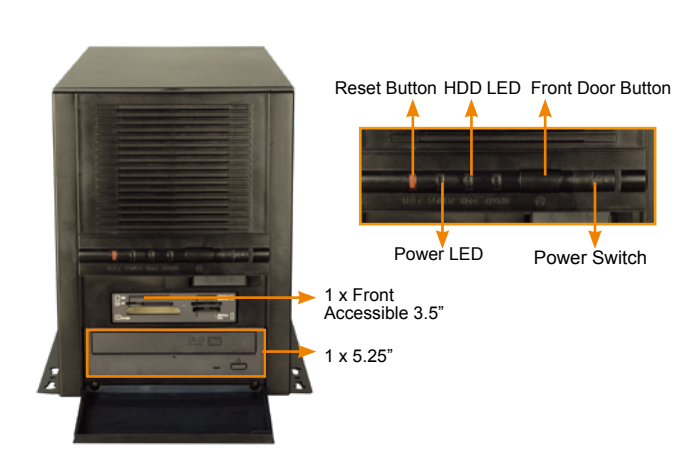
CD-ROM and HDD are not included in package.