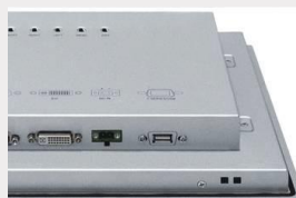
Rugged steel structure