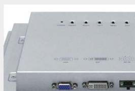
Control buttons on the rear panel